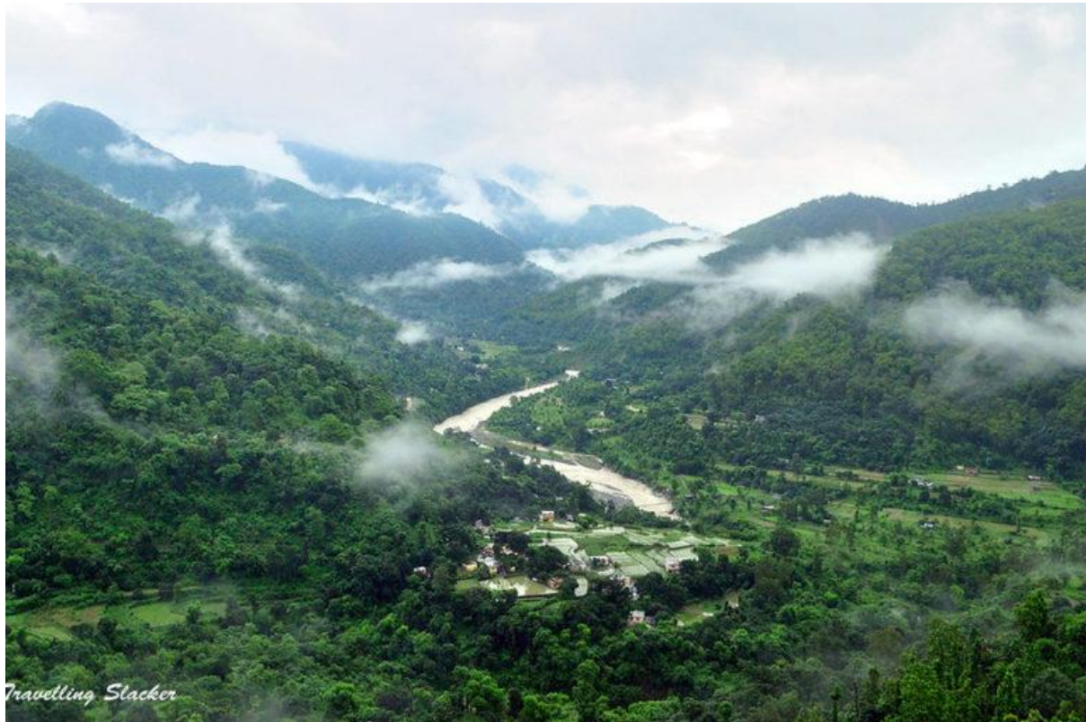
Nearly 2/3rd of Uttarakhand's total area is covered with forests.

“A bureaucrat-driven process with no local rights is not likely to produce benefits for communities or the people of the state, whatever the language of the policy. Instead, it may accelerate the environmental destruction and consequent natural disasters already taking place,” he said.